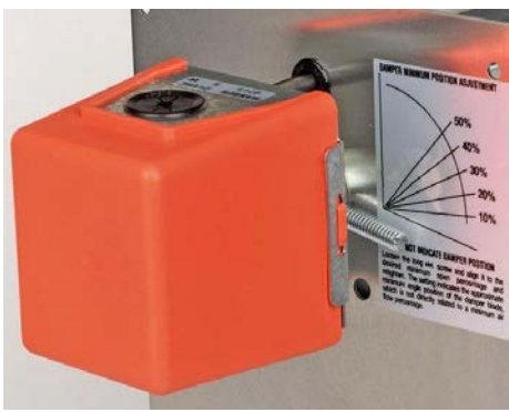
Minimum Position Adjustment

The RDL motor also has a simple adjustment for setting the damper to a minimum position. A minimum position allows for excess by-pass air. To set a minimum position, loosen the setscrew, align the setscrew to the minimum position label and re-tighten.